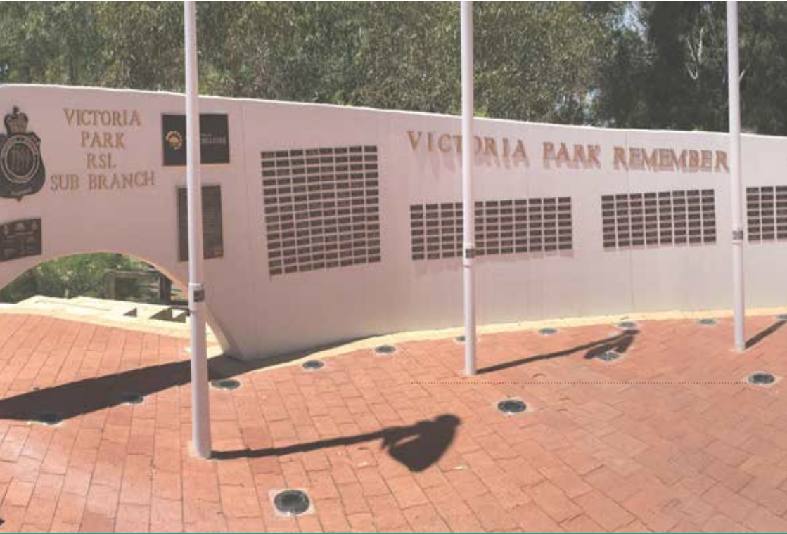
Panorama of the WWI Memorial Wall at the Victoria Park RSL. Officially opened April 2015 for the Centenary of Anzac.